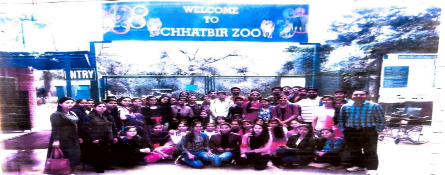
Students with Teachers at chhatbir Zoo, Zirakpur